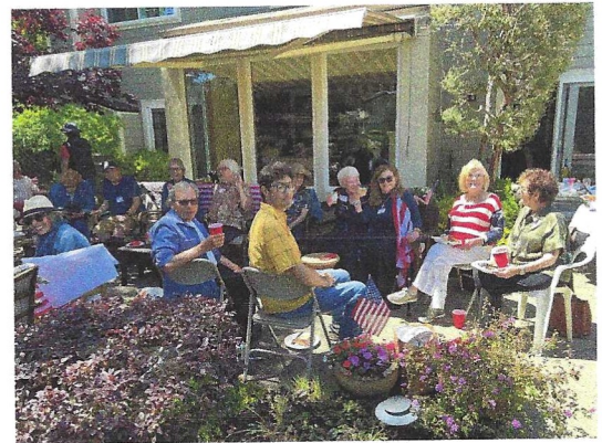
Happy Hour at Chevys 1